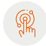
Virtual Shows & Events